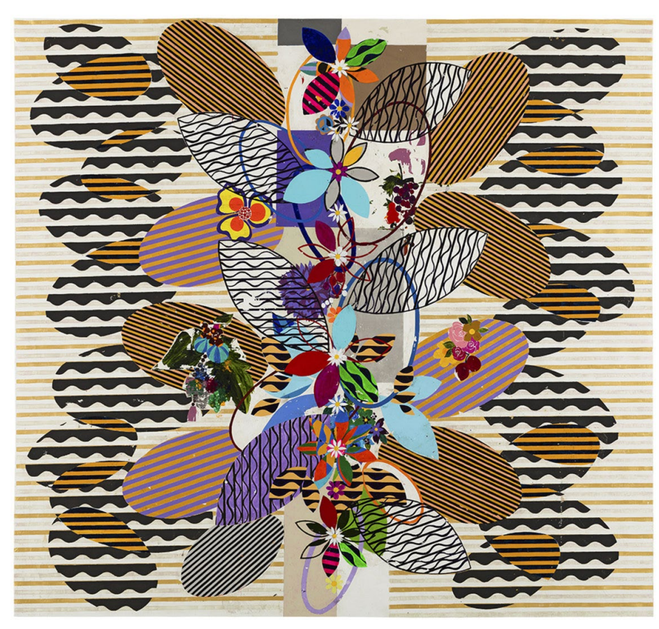
Banho de Rio, Beatriz Milhazes ©