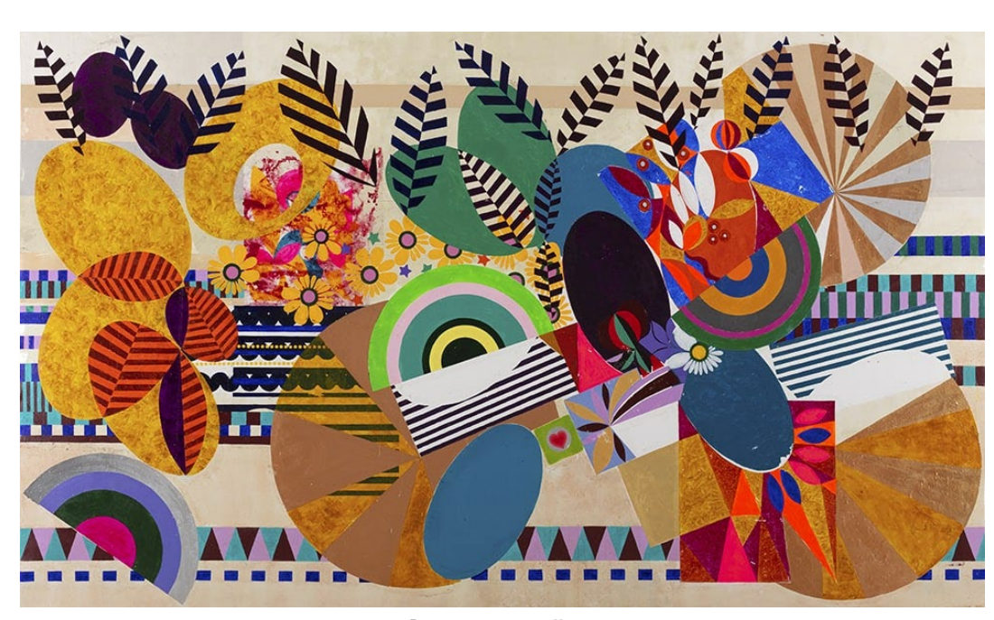
Benguelé, Beatriz Milhazes ©