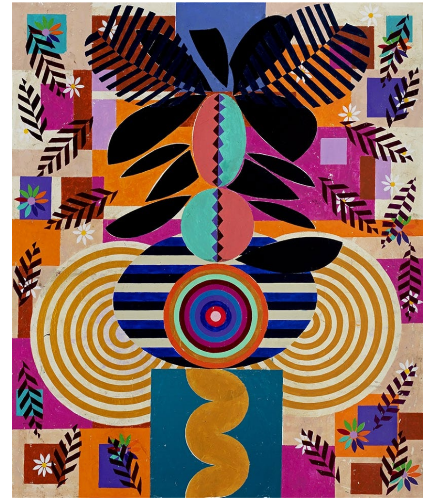
Ingênuo, Beatriz Milhazes ©