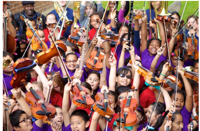
Bravo Youth Orchestras