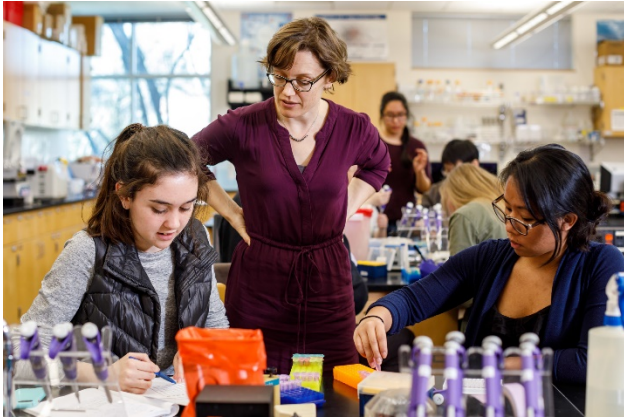
University of Portland