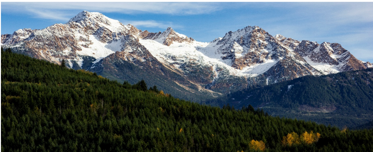
Whatcom Land Trust