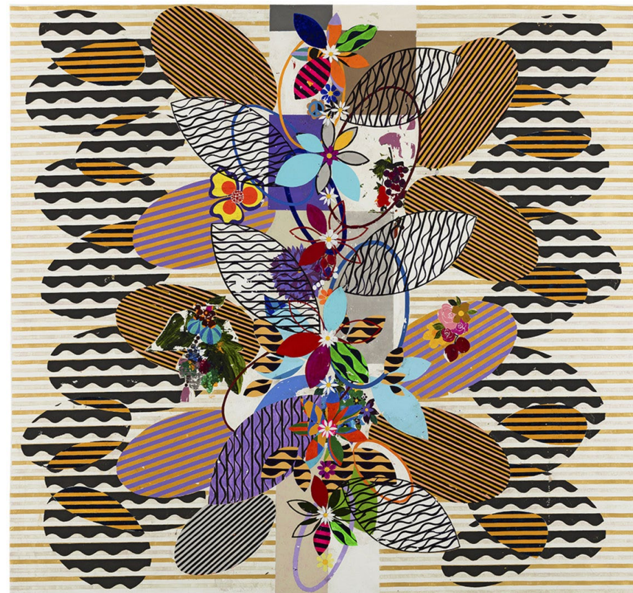
Banho de Rio , Beatriz Milhazes ©