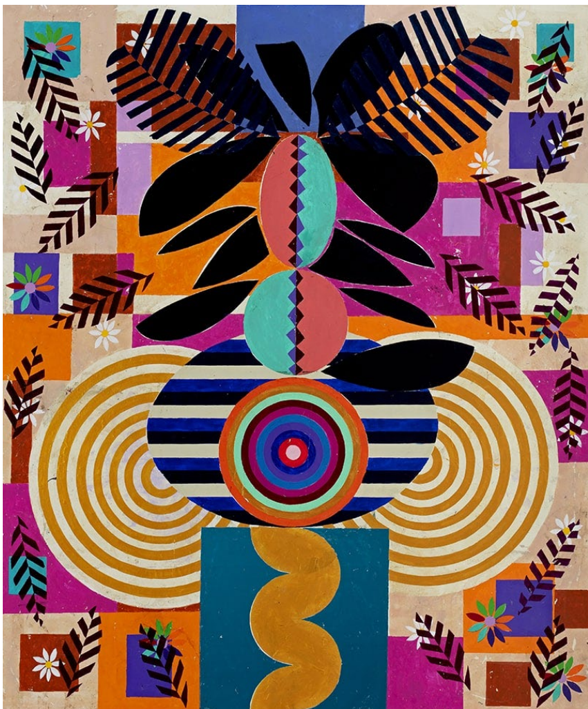
Ingênuo , Beatriz Milhazes ©