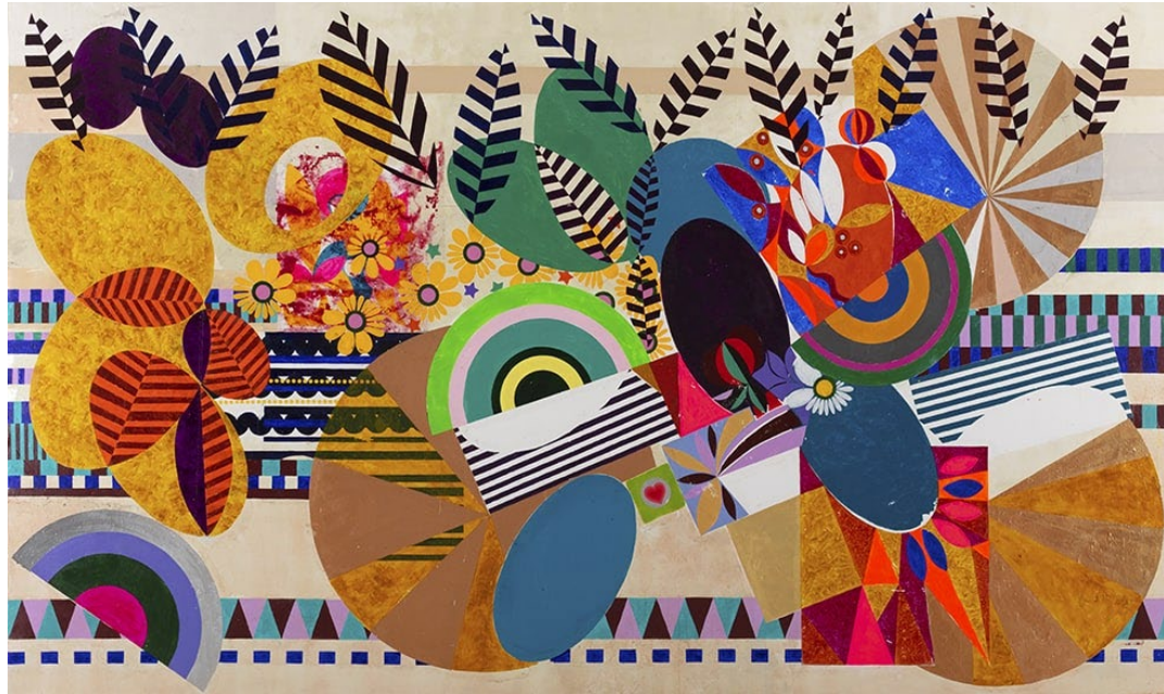
Benguelé , Beatriz Milhazes ©