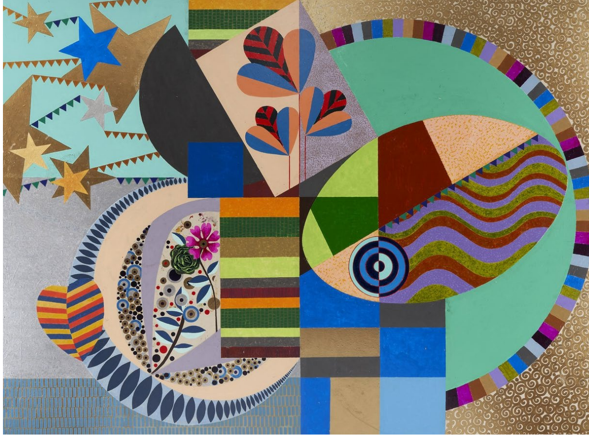
Mistura Sagrada